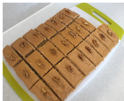
Very necessary sustenance at the break before singing choral evensong at St Andrew's